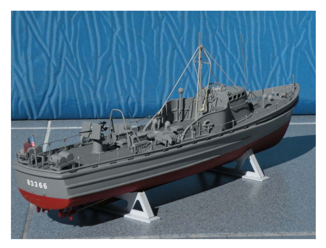
The finished model.

Now, here is how Mr. Sheppard-Capurro built the model of the CG-83366/USCG-11: