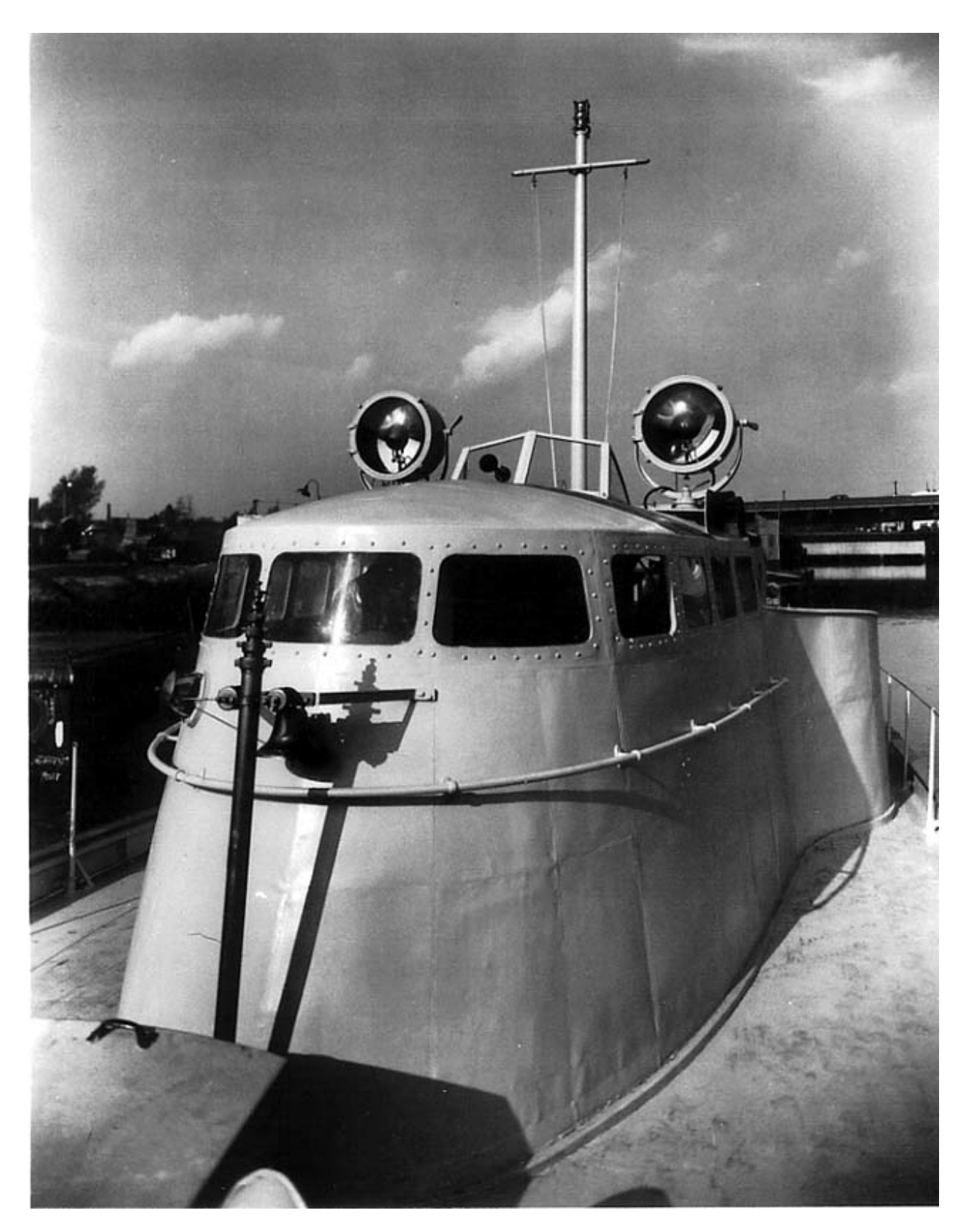
An Everdur cast-bronze wheelhouse.