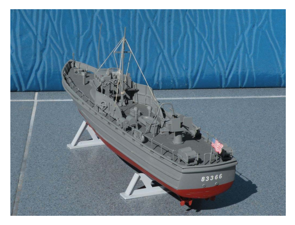
Mr. Sheppard did a very good job on this model.

These sixty cutters became USCG RESFLO-1 (Rescue Flotilla 1) and were based at Poole, England. The boats of this Flotilla deployed in two rescue groups of thirty boats each on June 6, 1944. They were responsible for rescuing fifteen hundred men on that day.