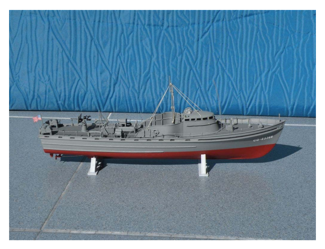
A good shot of the finished model.

From 1941 to 1945, these cutters (all USCG vessels are called cutters) were used for coastal patrol duties, coastal convoy escort duty and for Air-Sea-Rescue duty. In preparation for the June 6, 1944 allied invasion at Normandy, sixty of these cutters were shipped to England to participate in the landings.